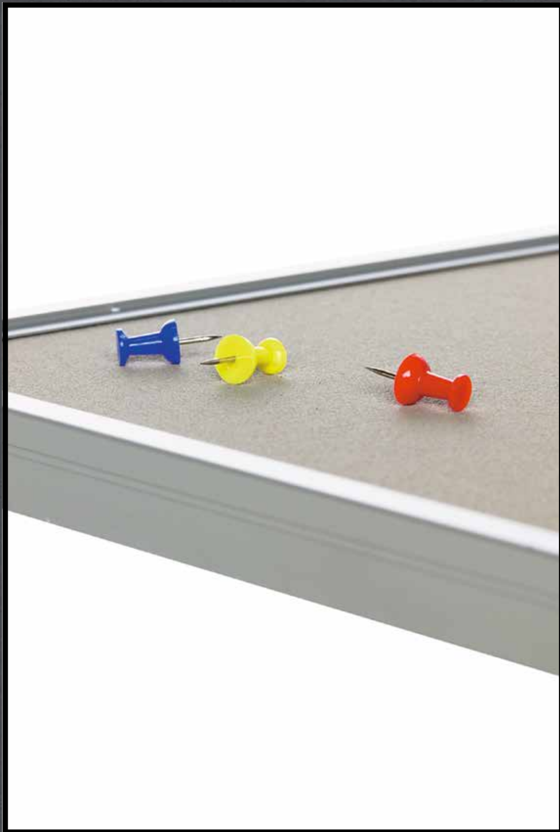
2187 | brown rice