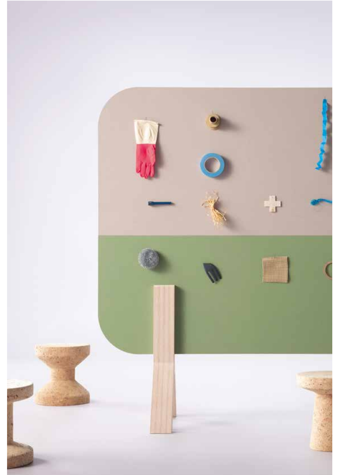
2187 | brown rice 2213 | baby lettuce 3363 | walton lilac

BULLETIN BOARD provides ideal solutions to the modern sustainable office environment where separation walls or furniture elements can double as information carriers.