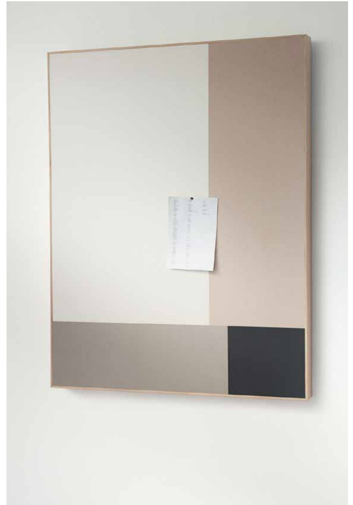
2182 | potato skin 2187 | brown rice 2206 | oyster shell 2209 | black olive

Framed bulletin board can be made in single colours that fit your needs or in decorative combinations that enhance your environment. All in various sizes and ideal to hold your thoughts or expose your creativity.