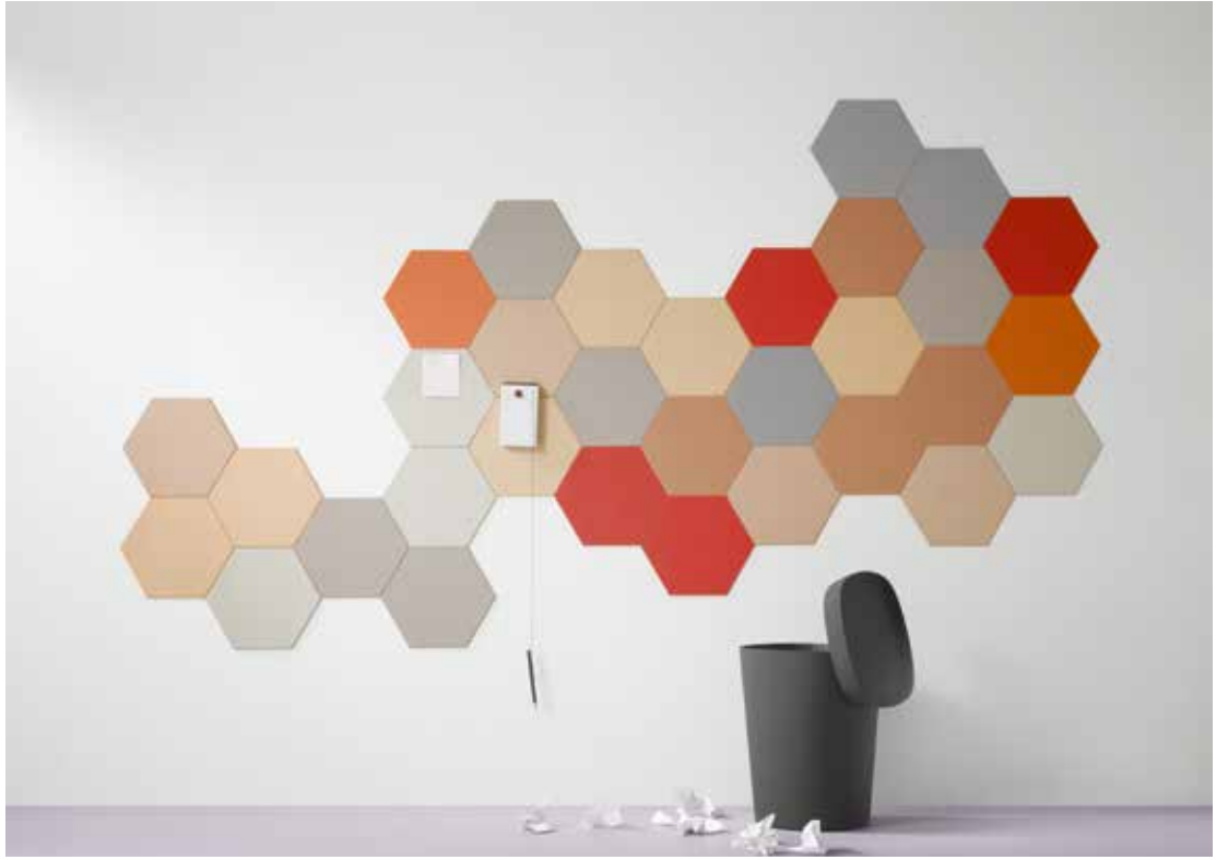
2210, 2207, 2166, 2162, 2206, 2182, 2187, 2186, 3363 | walton lilac

BULLETIN BOARD is flexible and easy to cut and handle, which allows you to create functional wall decorations with enchanting decorative effects.