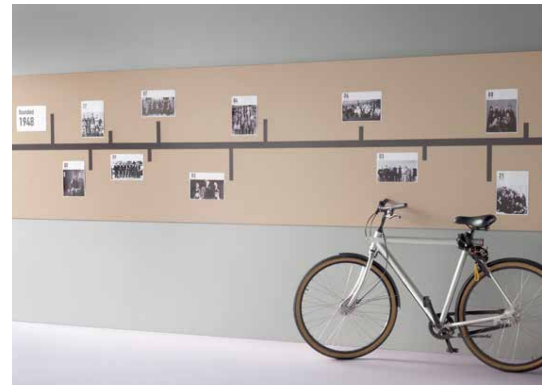
2186 | blanded almond 3363 | walton lilac