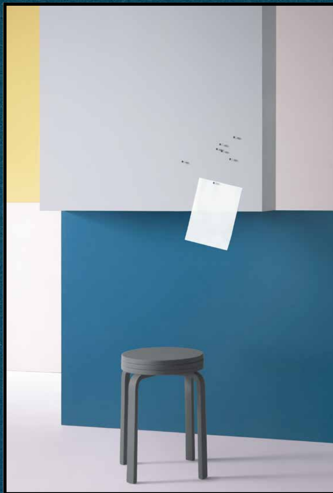
2162 | duck egg 2186 | blanded almond 2214 | blue berry 3363 | walton lilac