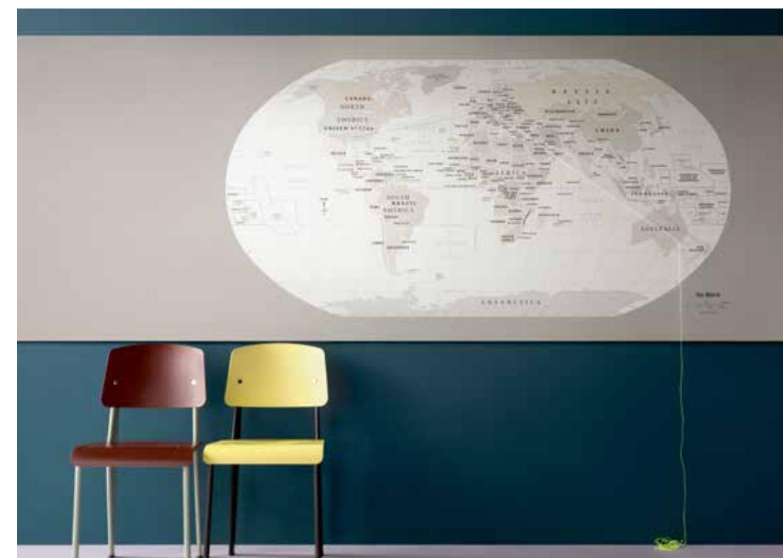
2182 | potato skin 3363 | walton lilac

BULLETIN BOARD is supplied in rolls of up to 28 metres long and 1.22 metres wide, making it suitable for large installation in for example conference rooms or alongside corridors. 3 colours are also available at 1.83m wide.