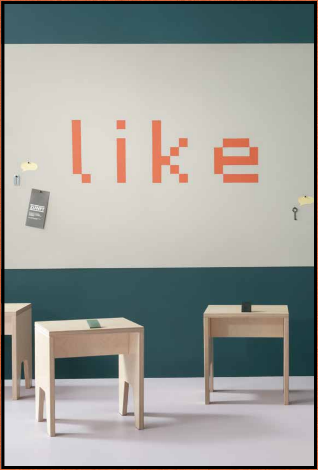
2206 | oyster shell 2211 | tangerine zest 3363 | walton lilac