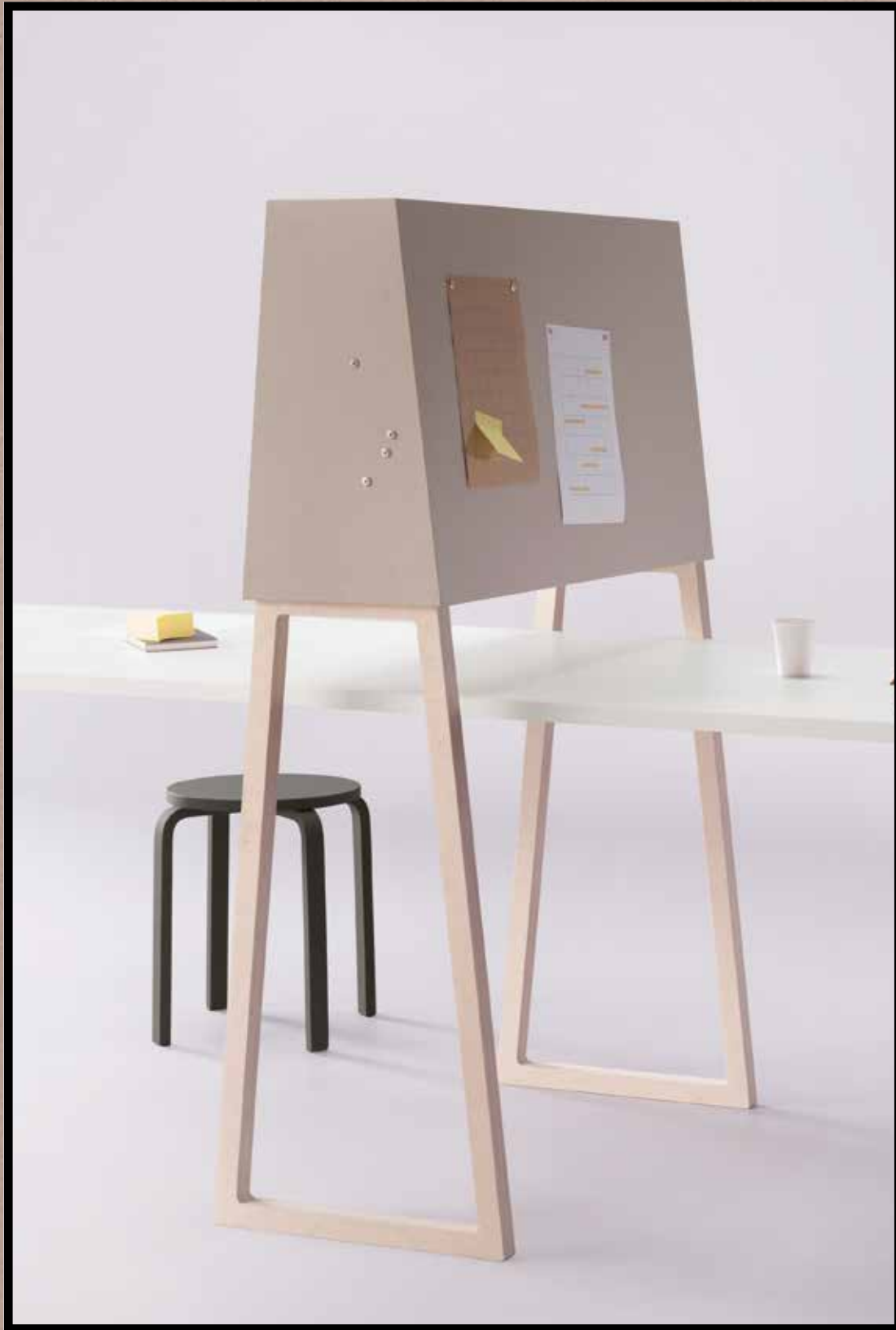
2187 | brown rice 3363 | walton lilac